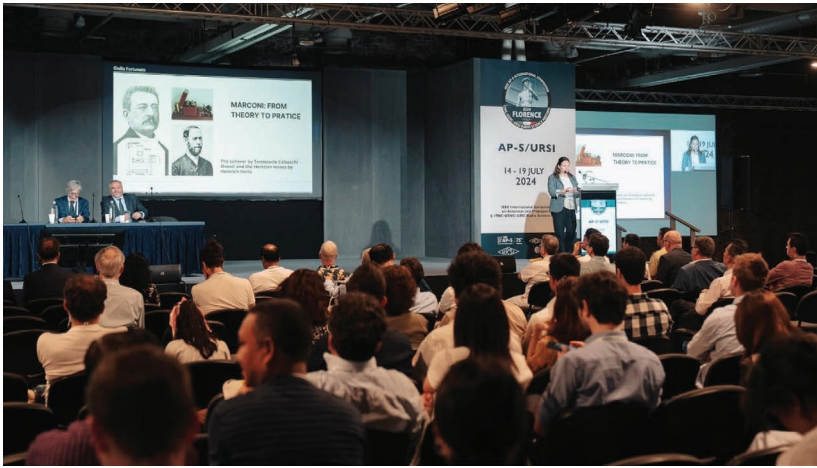
FIGURE 7. APS/URSI 2024 Plenary Session (Wednesday, 17 July), themed around Italian excellence in antennas, propagation, and electromagnetic technologies, with a motto “From Marconi to Future.”

conference, awardees, authors, members, and attendees.