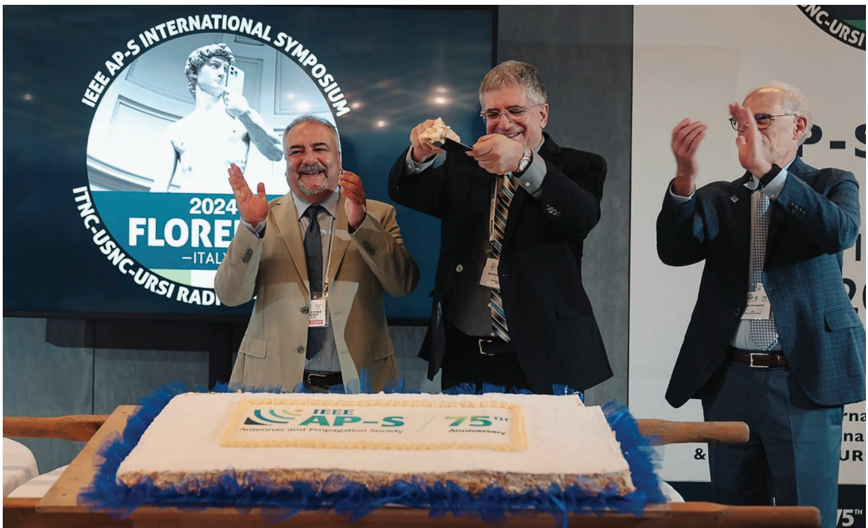
FIGURE 11. Cake-cutting ceremony at the 75 Years AP-S Celebratory Lunch (Thursday, 18 July). This was followed by the IEEE President serving cake to our students and attendees and by the AP-S President opening and serving champagne (Italian Prosecco) with a toast for the Society's 75th birthday.