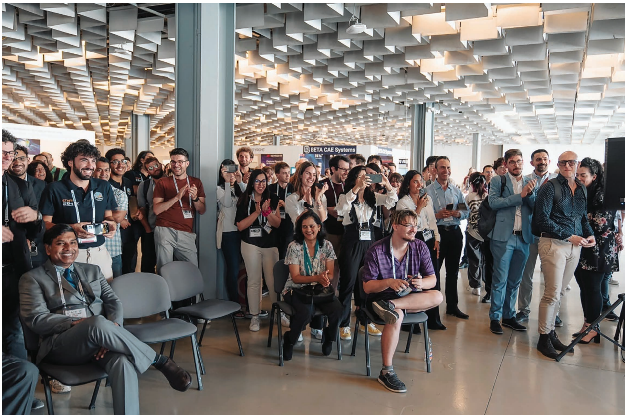
FIGURE 12. Students and other attendees enjoyed the cake-cutting ceremony in the Exhibit and Demo Area at Fortezza da Basso (Figure 11).