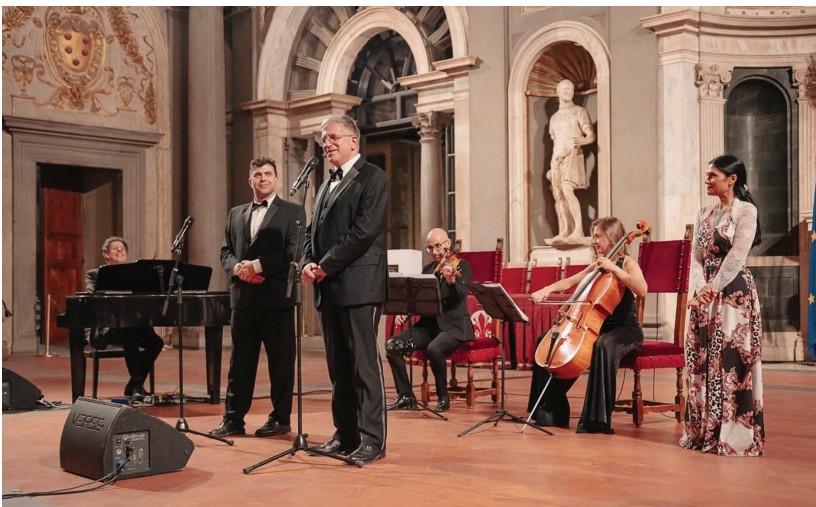
FIGURE 14. The highlight of the 75 Years Gala Dinner at Palazzo Vecchio (Figure 13) were fantastic performances by tenor and soprano singers and violin, cello, and piano players throughout the evening. The biggest surprise of the evening (and the entire conference as many said) was the AP-S President’s singing of Schubert’s “Ave Maria” (shown in the picture), where after the first few verses in Latin, per the original, I finished with English and AP-S 75 Years Celebration language. After the first shock, as everybody, including the musicians, thought that I was going to give yet another speech, many cheered this unplanned piece of entertainment and fun.

Florence. Our external guests were truly impressed with our Society, as well as our organization and hospitality.