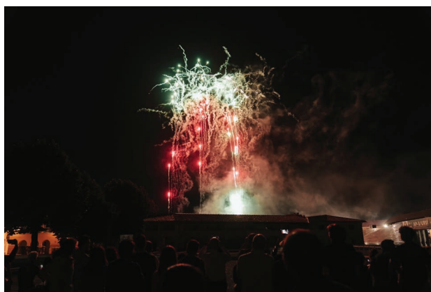
FIGURE 5. Conference attendees watched a spectacular APS fireworks on the grounds of the historic fortress, as a culmination of the Welcome Reception and Opening Ceremony of the conference (Figure 4).