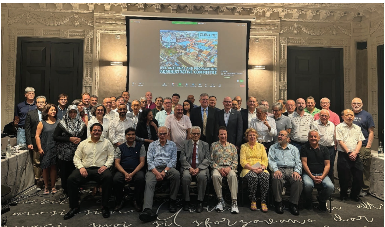
FIGURE 3. AP-S AdCom at Large Members during the AdCom meeting held on 13–14 July, 2024 in the Michelangelo Room of the Grand Hotel Baglioni in Florence, Italy, which discussed and approved a record number of 53 motions.

The first plenary event for the conference, with all attendees having a great time together, and the largest gathering of the week was the Welcome Reception, on Monday, 15 July, at Fortezza da Basso, with some speeches (Figure 4) and a lot of music and interactions, culminating in a magnificent APS fireworks on the grounds of this historic fortress (Figure 5). This was followed by the Students and Young Professionals' Dinner and Networking Event at the Stellar on Tuesday, 16 July. This event included a treasure hunt through some of the most historic parts of the city and across the Arno river (Figure 6). The APS/URSI 2024 Plenary Session, on Wednesday, 17 July, featured a very interesting journey through Italian excellence in electromagnetic technologies: "From Marconi to Future" (Figure 7).