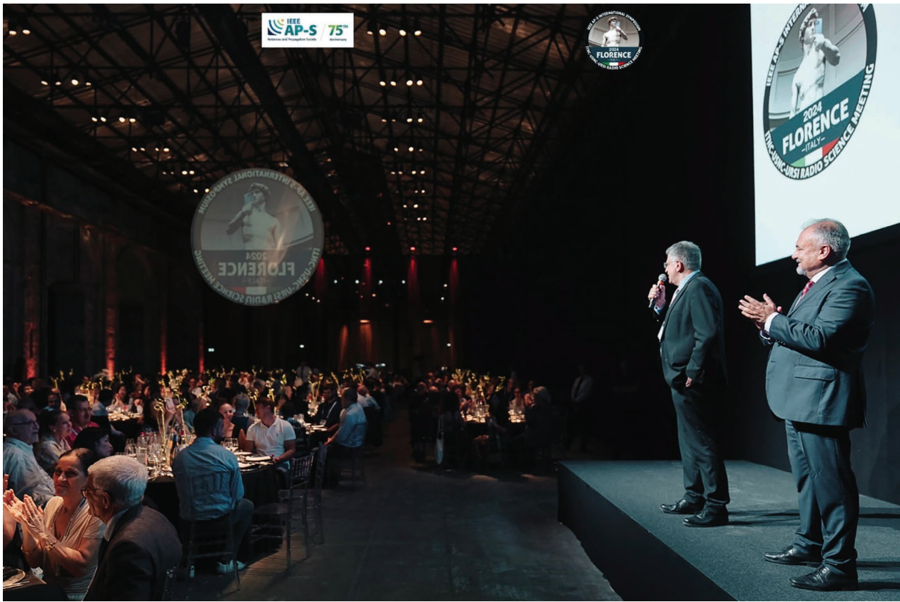
FIGURE 8. AP-S President (left) and APS/URSI 2024 General Chair greeted the attendees of the Conference Banquet–Social Dinner, at Stazione Leopolda, a beautiful and unique space evolved from an early 19th century Florence train station. This was followed by a delicious Tuscan dinner and fantastic live music entertainment, with a packed dancing floor.