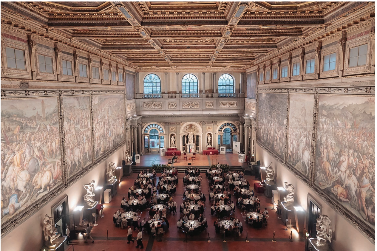
FIGURE 13. 75th AP-S Anniversary Celebratory Gala Dinner (Thursday, 18 July) in the magnificent Salone dei Cinquecento (“Hall of the Five Hundred”) at Palazzo Vecchio, the most historic and artistic building and hall in Florence. Due to the space limitation, this unfortunately had to be a “by invitation only” event for a small number of external and internal guests of the Society. Interestingly, the building is so historic that all of the food, supplies, and even musical instruments needed to be brought in by an aerial ladder through the window (the one seen at the bottom left of the hall) at a roughly third-floor level from the square (Piazza della Signoria). We are grateful to the City of Florence for making this event in their Town Hall possible and rather affordable to us.