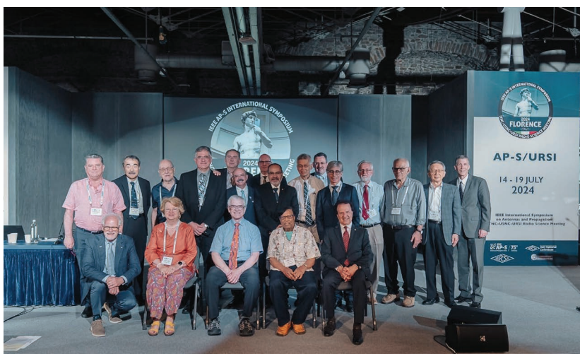
FIGURE 10. A group of AP-S Past Presidents after the AP-S Past Presidents Panel (Thursday, 18 July), which featured chronological presentations by as many as 23 Past Presidents (not all are shown in this picture), with highlights of their presidential terms.

AP-S had a fantastic seven days in Florence. What an intense week! For me personally, this was one of the busiest weeks of my career, with many months of preparation for it. It was also one of the most pleasurable and rewarding weeks of my career. I truly enjoyed interacting with so many AP-S volunteers, members, and conference attendees. I also enjoyed hosting so many of our guests for our 75 Years Celebration in