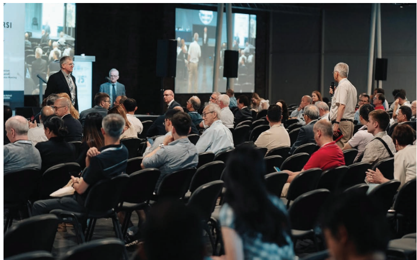
FIGURE 9. A lively discussion during the 75 Years AP-S Plenary Session (Thursday, 18 July), which featured an AP-S overview (by the AP-S President), IEEE overview (by the IEEE President), AP-S history (by the AP-S History Committee Chair), and six technical talks on the 75 Years of AP-S Research and Applications, given by AP-S technical leaders in the respective areas.