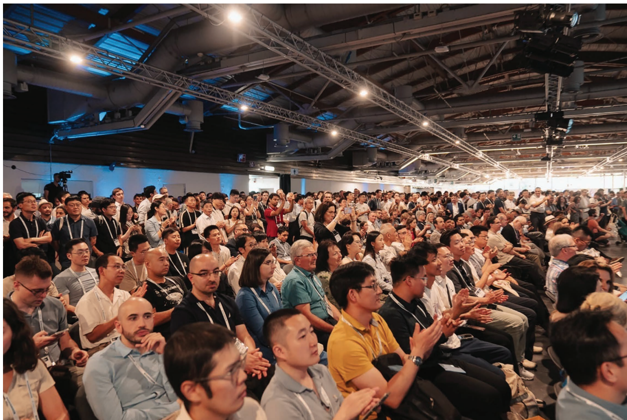
FIGURE 4. Welcome Reception (Monday, 15 July) at Fortezza da Basso, in Florence, where APS/URSI 2024 attendees and their family members first enjoyed some entertaining speeches and then engaged in fun activities and interactions. As a result, new friendships and networks were created, many of which were further enhanced at subsequent technical, professional, and social events of the conference.

Paper Competition Awards, AP-S Student Design Contest Awards, and some other awards are recognitions were presented. This was followed by the APS/URSI 2024 Conference Banquet–Social Dinner, at Stazione Leopolda, another historical landmark of Florence (Figure 8), which celebrated the